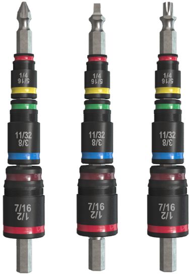
MTP2 #2 Phillips